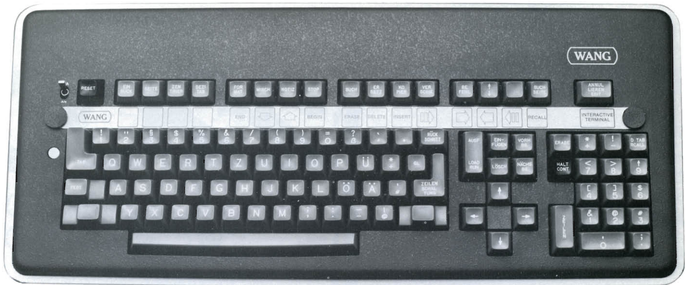
Model 2876DW Keyboard

Models 2876DW and 2886DW offer both data processing and word processing capabilities. These models support the optional 2200 Word Processing Software System that adds word processing capabilities compatible with those of other Wang products such as the Word Processing System, the Office Information System, and the VS Integrated Information System. The 2200 Word Processing Software System offers features that include operator prompts and automatic word wraparounds. Other operational features are automatic indexing for superscripts and subscripts; automatic centering, indenting, and decimal alignment; global search and replace; text movement; text copy; and right margin justification.